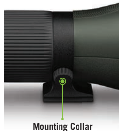
Mounting Collar Thumb Screw

Rotate the Diamondback® scope body for a variety of viewing positions — shown here with the angled eyepiece.